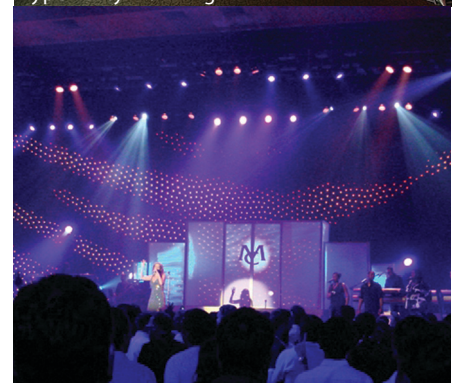
Hype Party Planning

Have you tried Everything S+H have to offer?